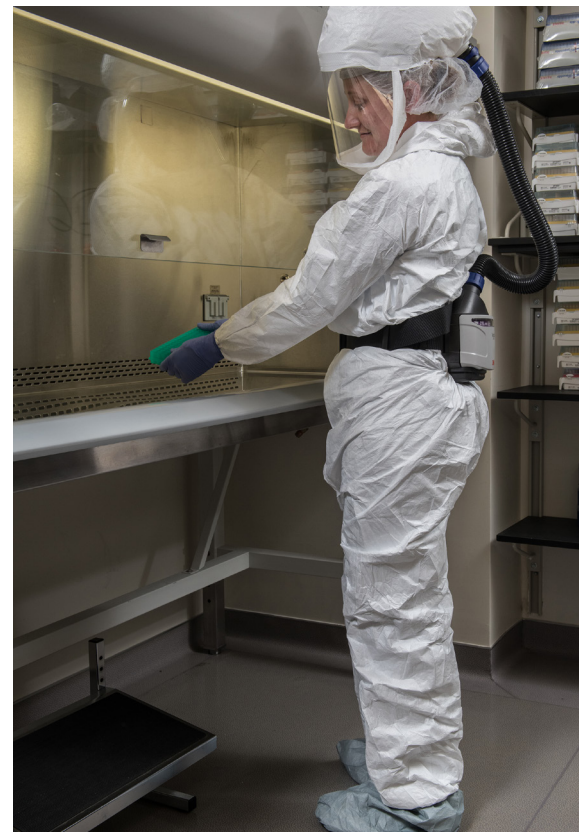
CDC scientist prepares an experiment inside of a class II biological safety cabinet (BSC).