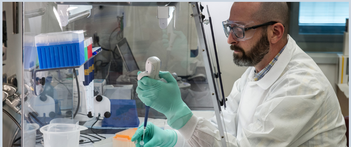
Centers for Disease Control and Prevention (CDC) scientist implementing molecular testing.

Currently, the ICLN is planning an ILCE for FY2024 involving an environmental release of an opioid agent, loosely based on a 2018 ICLN tabletop exercise where a wide area was contaminated with opioids. Stay tuned to future newsletters for more information.